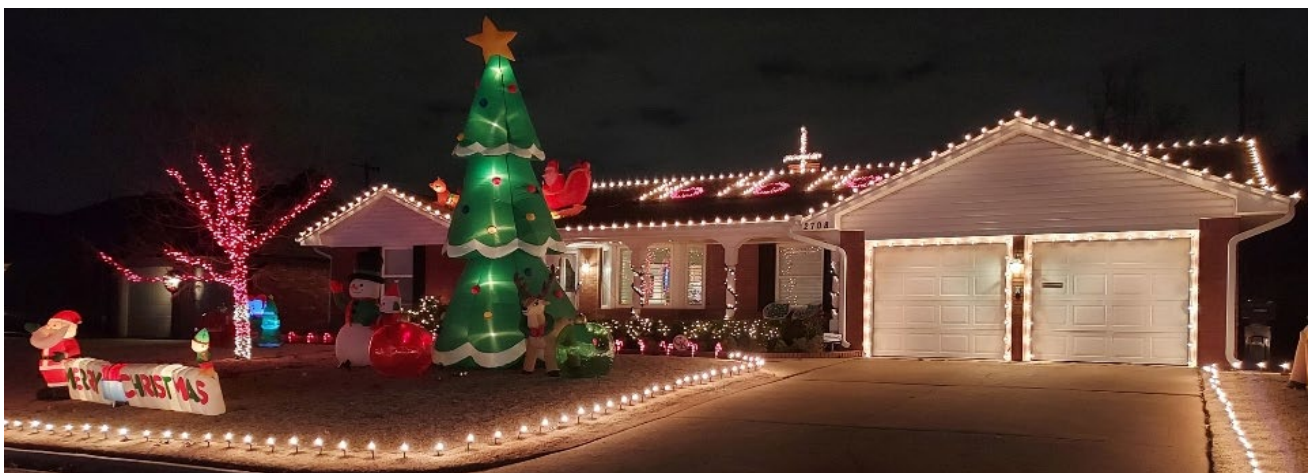
1 st Place Winner, 2022