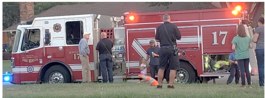
Firefighters from Station 17 (the firehouse is only a mile from our neighborhood) interacted with adults and the kids got to meet real firefighters and role models!