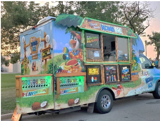
Kona Ice Food Truck in Belle Isle Park for Neighbor's Night Out.

What a great turnout we had for the annual Neighbor's Night Out (NNO) event! About 80 residents of all age groups gathered at Belle Isle Park. The Oklahoma weather broke the 100-degree streak to grace us with a lovely evening of mild temperatures, no rain and a gentle breeze. There were reunions of neighbors who had been out of touch due to the COVID-19 pandemic as well as new friendships begun. BIW treated every neighbor to one (or more) snow cones from Kona Ice. One kind gentleman even brought food to share. It was great to see children and adults enjoying our park and so nice to meet two young families from the 2400 block on 59 th St. Soon funds from the 2017 bond election should become available to make needed improvements to Belle Isle Park, 2701 NW 62 nd St. Thanks to everyone for attending! See NNO, p. 2